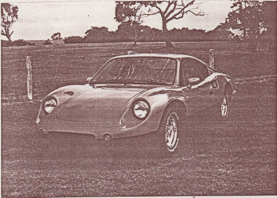
Marauder Sports Cars. Shop 1, 642 Port Road, BEVERLEY. SA 5009 Ph: (08) 45 4483.